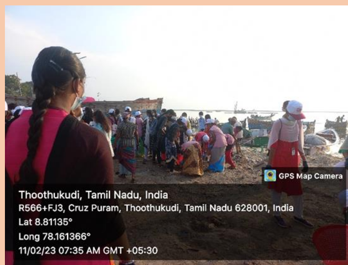
Coastal Cleaning at Threspuram, Thoothukudi on 11th February 2023

On 11.02.2023 as part of the Community Development Programme of the Department of History, St. Mary's college (Autonomous)-Thoothukudi arranged coastal cleaning programme on the sea shore of Threspuram Coastal are along with Coastal Cleanup of Thoothukudi Corporation. The programme was sponsored by Ocean Network Express and various organisations. Nearly 100 families of the in an around area were the beneficiaries.