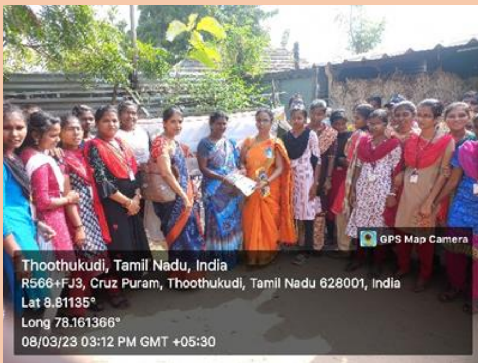
Women's day Women's Day at Keezhalagapuri. Awareness on empowerment of women through higher education by distributing the pamphlets on 8th March 2023